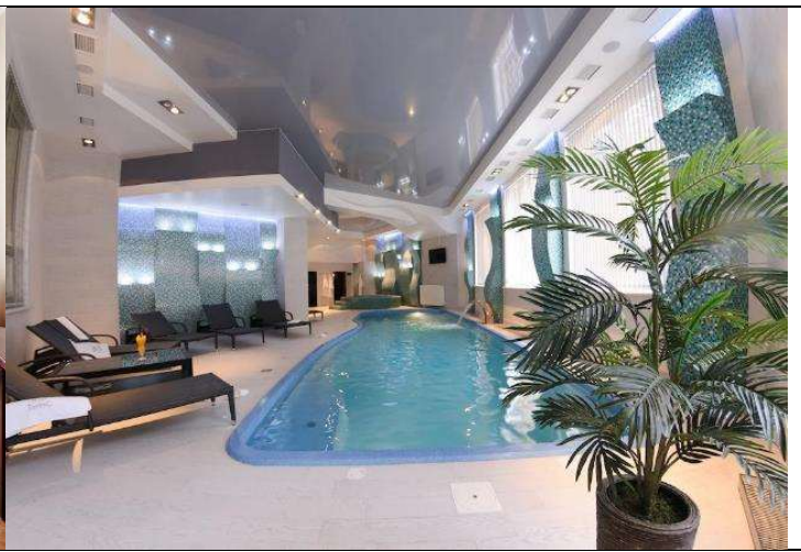
Premier Hotel Dnister 4*